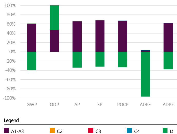
Figure 3 LCA results for the steel sections, rails and rolled billet

For the ADPE indicator, the benefit in Module D is much greater than the impact from manufacturing in A1-A3 and this results from the worldsteel 'value of scrap' calculation being based on many steel plants worldwide. In the case of ADPE, the Module D benefit is greater than the steel manufacturing burden because the Scunthorpe liquid steel production process is more efficient than the average (the Module D benefit being a reflection of the world-wide steel plant average).